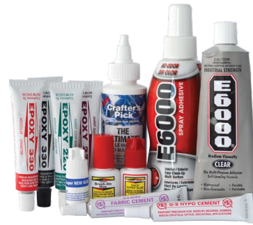
Absinthe Fairy hair pin by Sondra Barrington Sondra used Epoxy 220 (#60-220) to glue the focal piece to a hair pin.