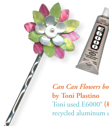
Can Can Flowers bobby pin by Toni Plastino Toni used E6000® (#60-260) to glue her DIY recycled aluminum can flowers to the bobby pin.