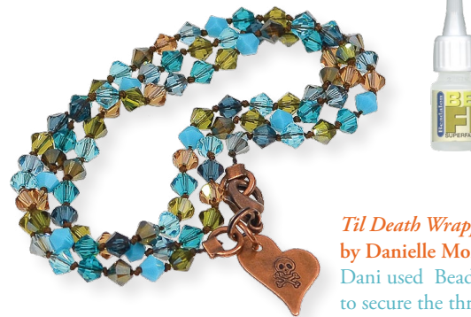
Til Death Wrapped Bracelet by Danielle Montgomery Dani used Bead Fix™ (#60-242) to secure the thread knots.